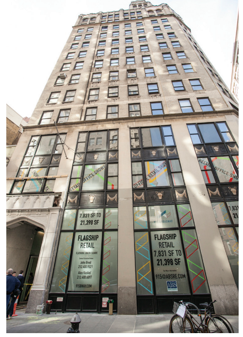
Exterior of 915 Broadway