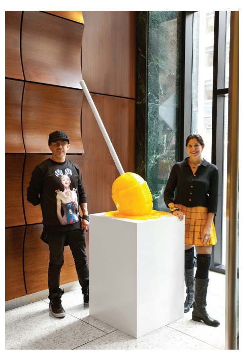
... and Meltdown at 1001 Sixth Avenue